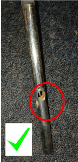
Probe with sensor enclosed