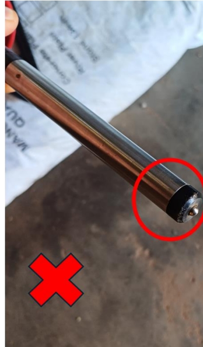
Probe with sensor NOT enclosed